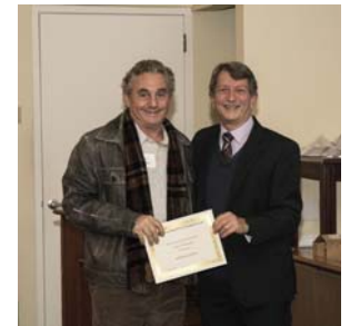
Image of the Year Award Winners