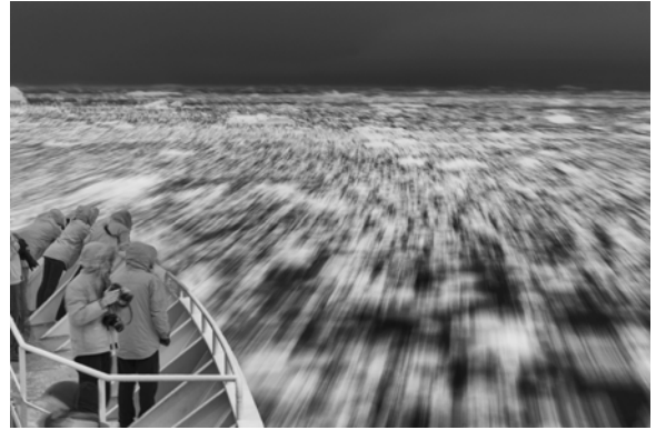
"Cutting Through Ice" - Jeff Lipshitz